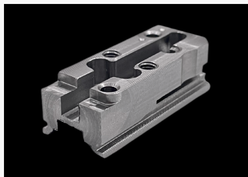
Bolt for the P17 pistol, which Keltec was able to produce over 200% faster (and with 1/6th the labor) once machining was switched to the Eurotech Rapido.

Adrian continues and reveals, "One of the most complex CNC parts of the P17 is the bolt, and we needed the volume to increase dramatically. We were producing these on two horizontal machines across three shifts with six employees. Then, one of our programmers looked at the part and determined that the actual sizing of this would lend itself to a Eurotech Rapido. We went from 45 parts per shift on a single horizontal machine up to 185 parts, and the 185 parts were from a single Eurotech run by a single operator who could attend